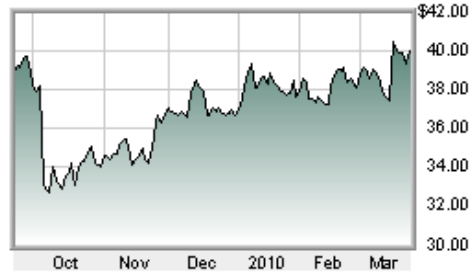
ST JUDE MED INC as of 3/23/2010